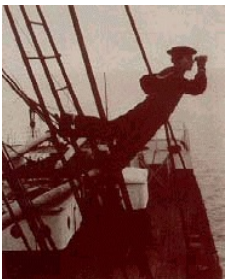
Buster Keaton looking expectantly "The Navigator" 1924

Comment - Note that the very first word in the Greek manuscript of the Book of the Revelation (not " Revelations " as is so commonly called) is the noun apokalupsis (apokalypsis) derived from apo- which means from and kalupto which means to cover or conceal . Taken together the simple idea is to take the cover off and expose to open view that which was heretofore not visible, known or disclosed. It means to make manifest or reveal a thing previously secret or unknown. In all its uses, " revelation " refers to something or someone, once hidden, becoming visible and now made fully known. And so using this word first, the Spirit is showing us that He is unveiling truth about the future which was previously concealed. The point is that the Revelation has been given to men by God to reveal not to confuse . And yet it is the most